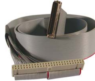
TA105: ribbon cable with 50 pin ribbon cable connector and 50 pin SCSI-2 male connector

The transition module supports TXD, RXD, GND for each set of the eight channels of the TPMC866-10x (RS232) and Dx+/-, GND for the TPMC866-12 (RS485 HD configuration). On board termination is provided for RS485. Termination can be activated by jumper. A two pin screw terminal (X9) can be used to supply the on board termination for RS485.