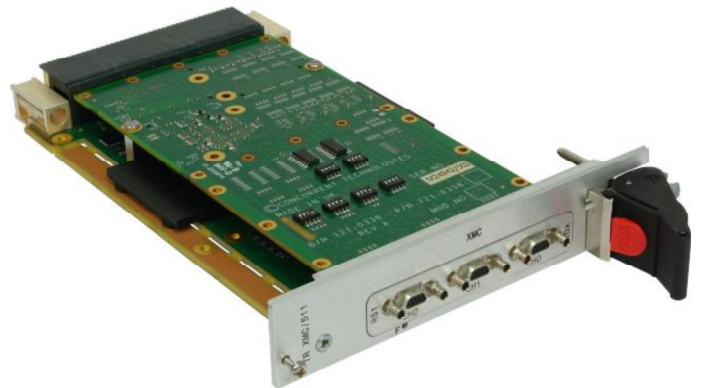
Air-cooled variant: 8 x Serial Communication Ports