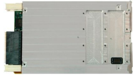
Figure 1: Without 2LM Type 1 Covers