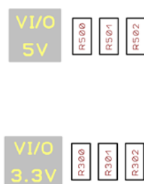
Figure 5-1 : PCI Signaling Voltage Configuration Resistors

The V_I/O signaling voltage level is configured by three resistors. To change the voltage level, these resistors must be soldered to the appropriate soldering terminals. They are grouped and labeled appropriately.